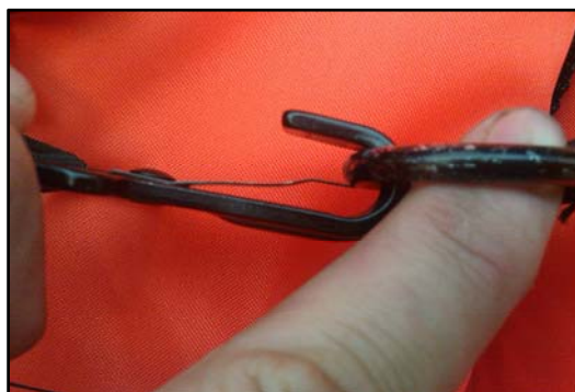
Figure 2. Faulty Spring Clip - too long to latch

Coast Guard Domestic Vessel Inspections Branch: (504) 365-2240 Coast Guard Sector New Orleans Command Center: (504) 365-2200