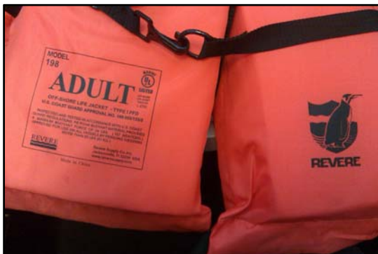
Figure 1. Revere Model 198 Life Preserver