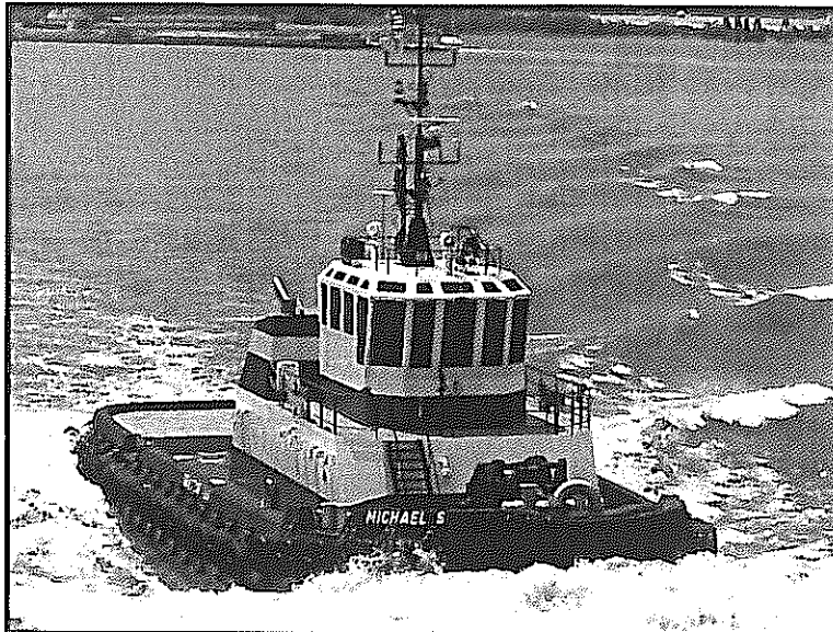
Tractor Tug Michael S.